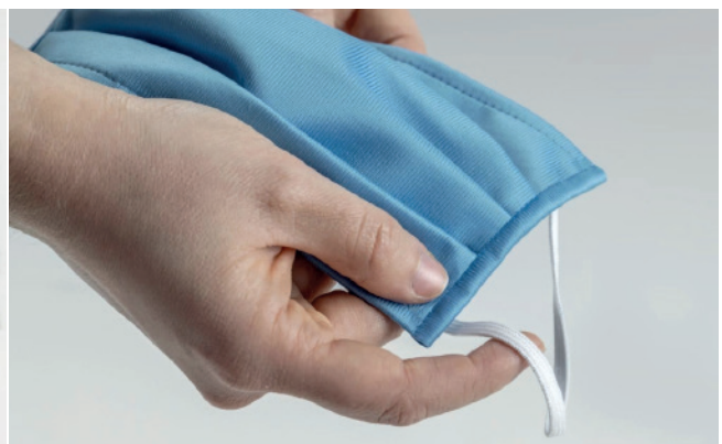
Available in the colors light blue, green, grey and white.